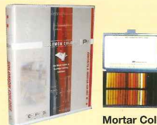
Mortar Color Kit