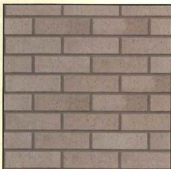
With SGS Mortar Color: 45A